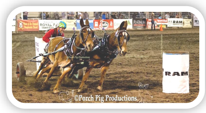
Ralph with Gyp & Jude