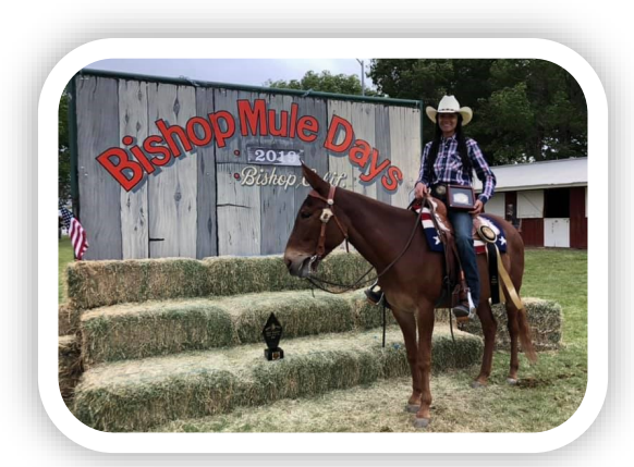
Strawberry & Abby