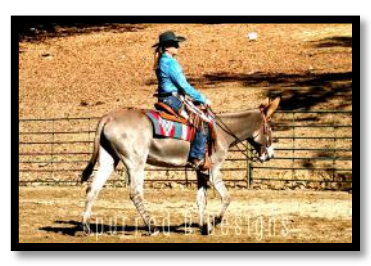
Platero & Becky